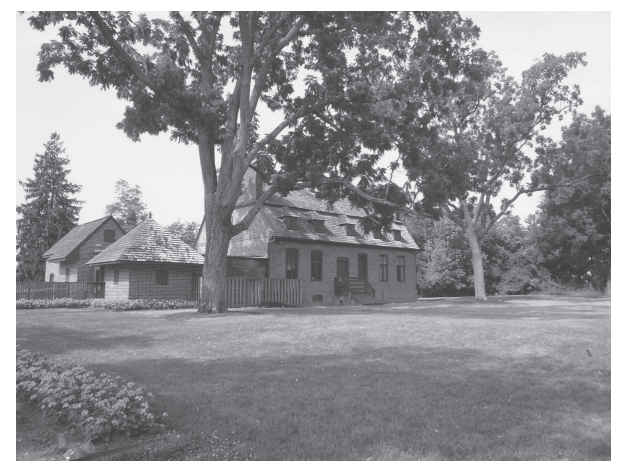
Darnall's Chance Grounds