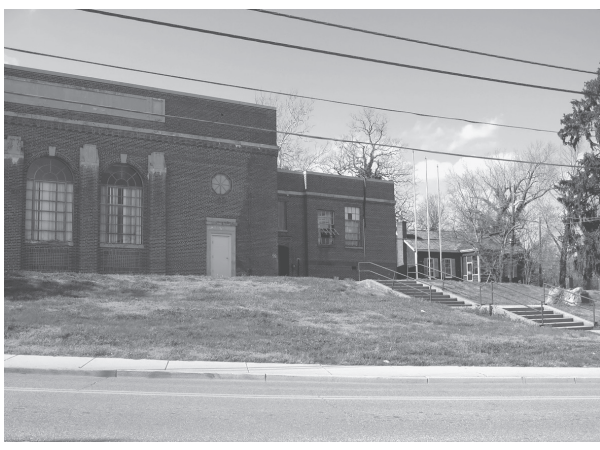
Old Marlboro Academy Site