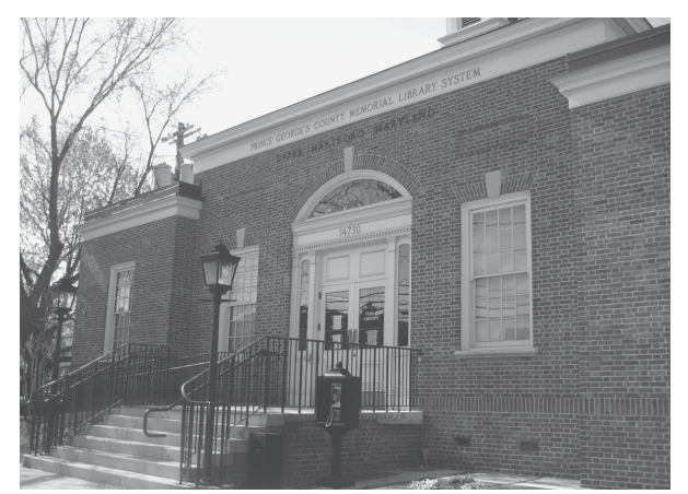
Prince George's County Library

Prince George's County offers a credit on the county property tax for the restoration and preservation of historic sites, contributing resources in local historic districts, and historic district infill. Properties identified as historic sites in the Historic Sites and District Plan qualify for a ten percent credit on eligible restoration/preservation expenses, and properties located in a designated historic district qualify for a five percent credit on building construction costs for new construction adjacent to and architecturally compatible with structures having "historic architectural or cultural value within the historic district." (As Upper Marlboro does not have any historic districts designated in the Historic Sites