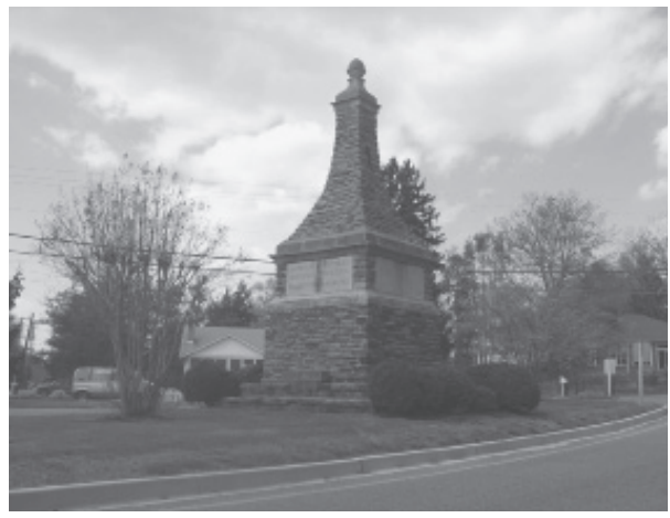
Marlborough Entrance Gateway