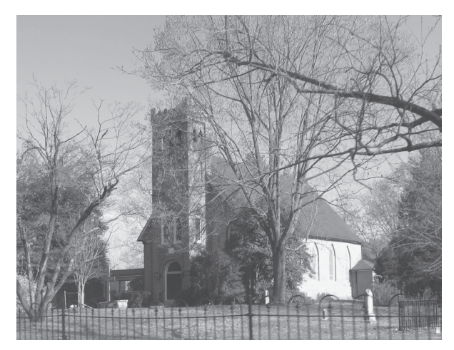
Trinity Episcopal Church

Many communities create heritage trails that link historic resources together in a way that helps tell the story of a city or town's history. The Town of Upper Marlboro should work with the Prince George's County Historic Preservation Commission, local historical societies, and other community groups to develop plans for trail routes, conduct historic research, and create interpretive signage, maps, and brochures. Signage for this tour also could be coordinated with plans for wayfinding signage in the town core.