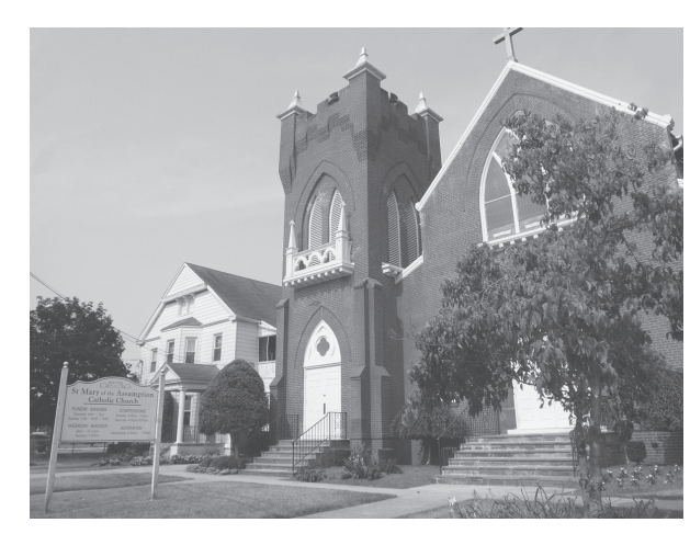
St. Mary of the Assumption Catholic Church